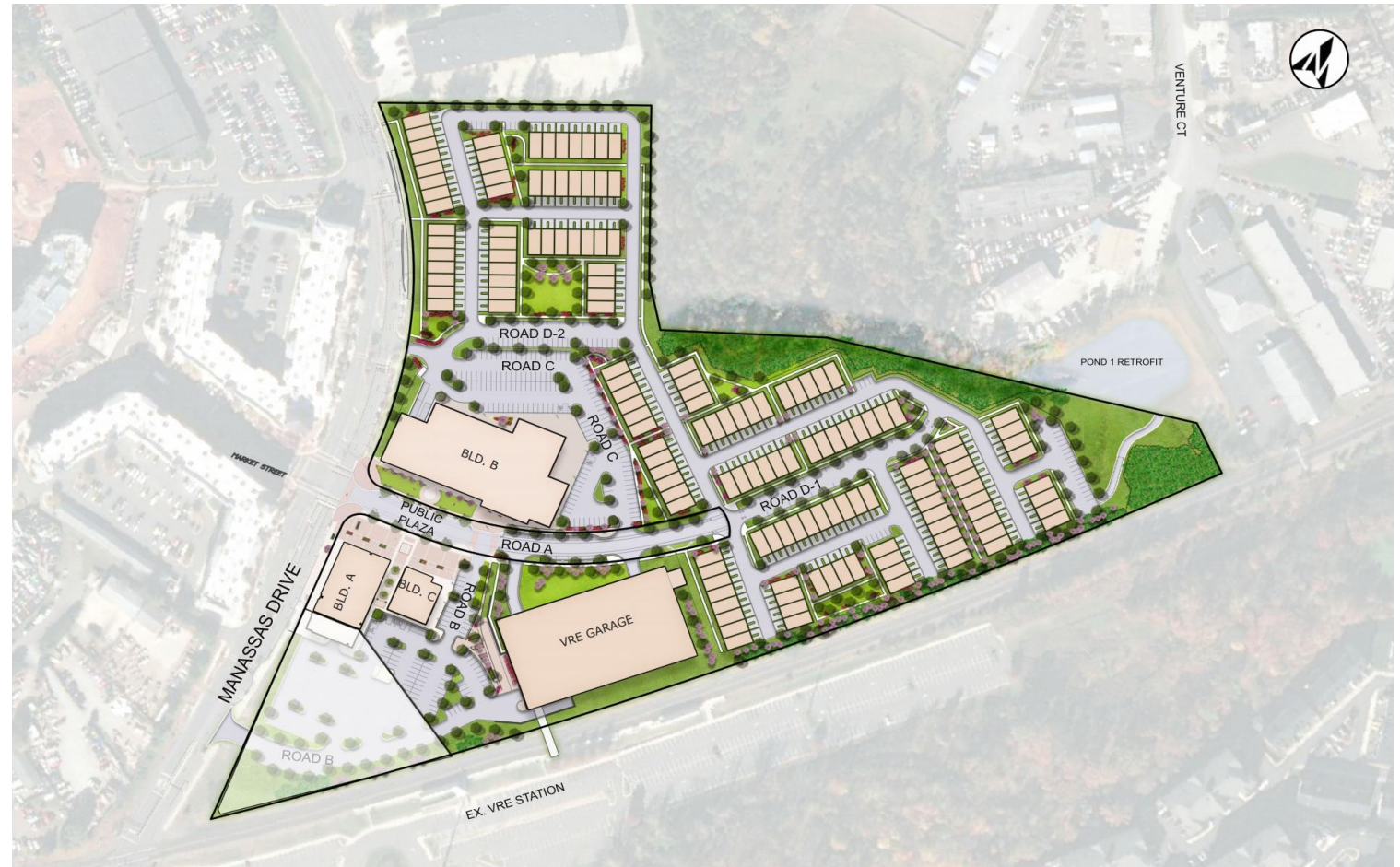
Master Development Plan for the Village at Manassas Park.

This proposal was subsequently accepted by the City's Governing Body and on June 16, 2020, a Comprehensive Development Agreement between the City and the developer was adopted alongside approval of the Phase 1A Rezoning of the property.