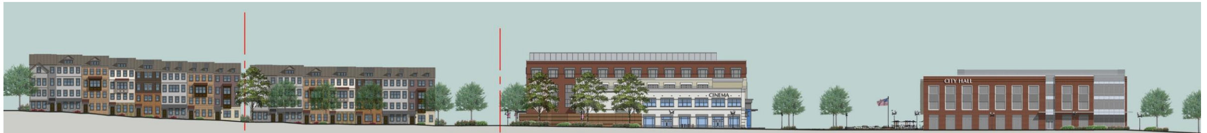
Elevations of buildings along Manassas Drive.