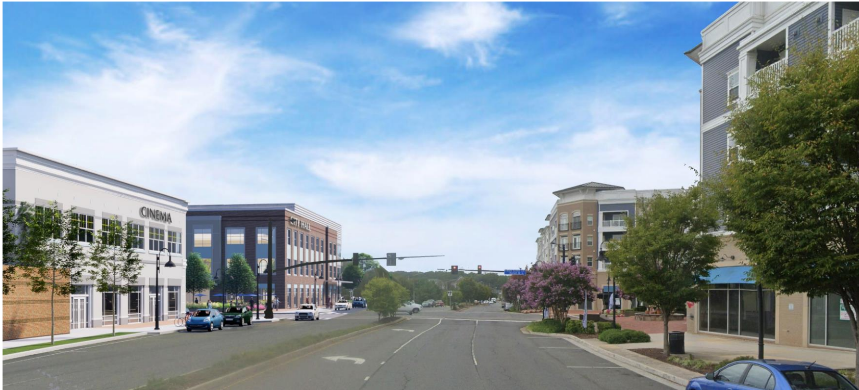
Future intersection of Manassas Drive and Park Center Court.

Norton Scott has submitted a rezoning application for Phases 1B and 2 of the development.