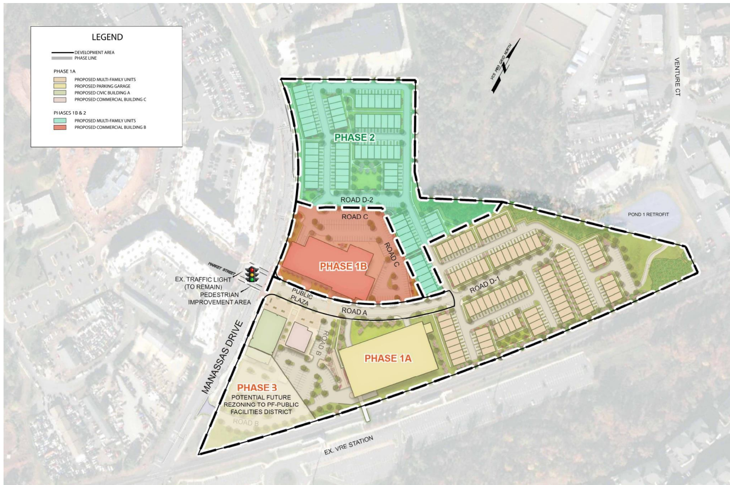
Phasing Plan for Village at Manassas Park.